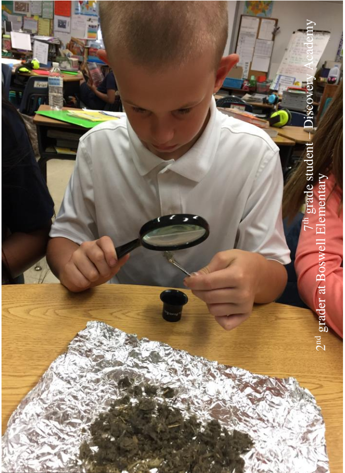
7 th grade student – Discovery Academy 2 nd grader at Boswell Elementary